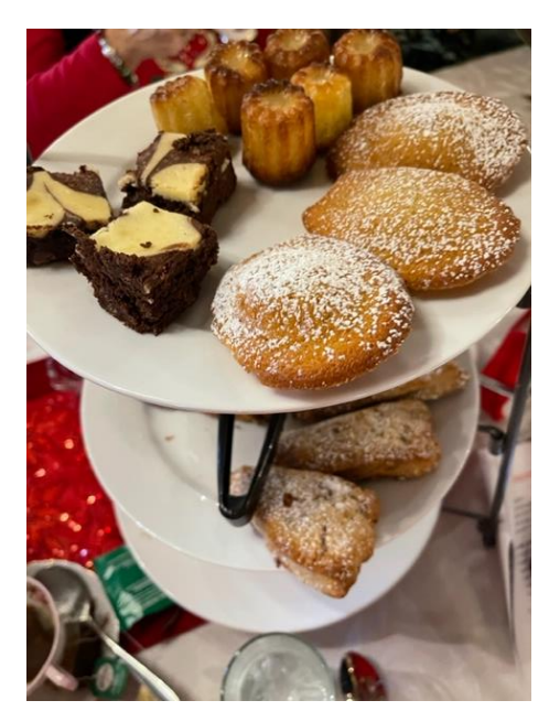
Tea Party Treats