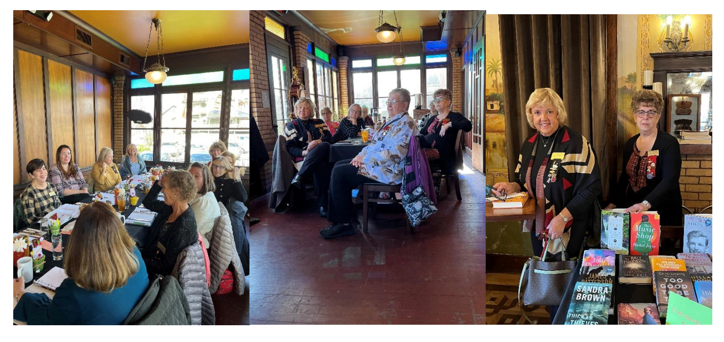
November meeting attendees