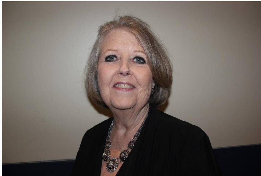
2022-2024 President of Alpha Upsilon Chapter