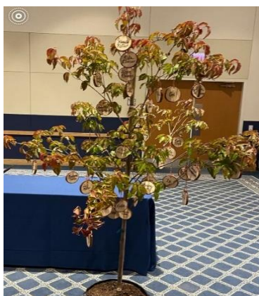
Celebration of Life Tree with ornaments