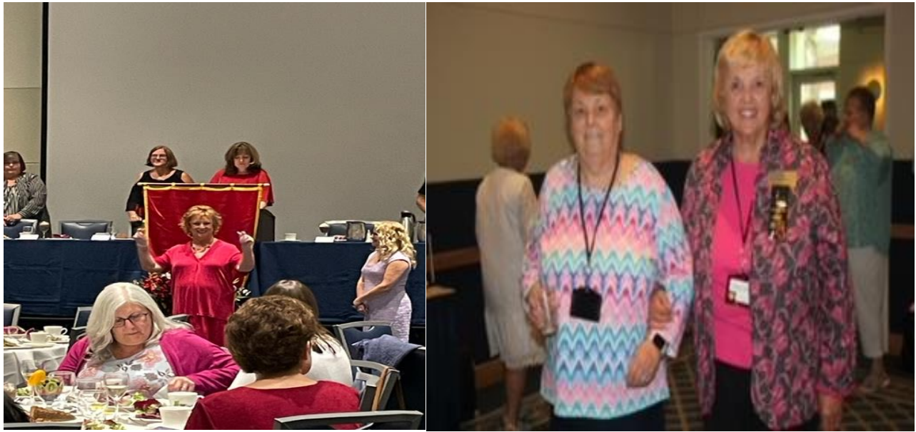
Active Alpha Upsilon Convention Goes