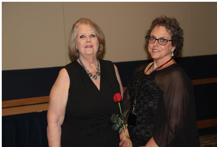
Passing of the Rose Ceremony – A New Biennium Begins