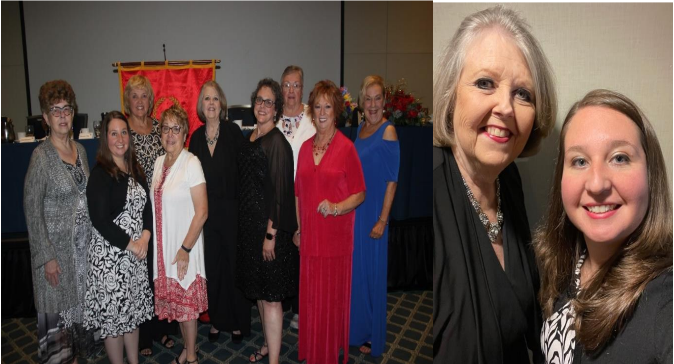
Alpha Upsilon Chapter Members in Attendance at 2022 PA State Convention